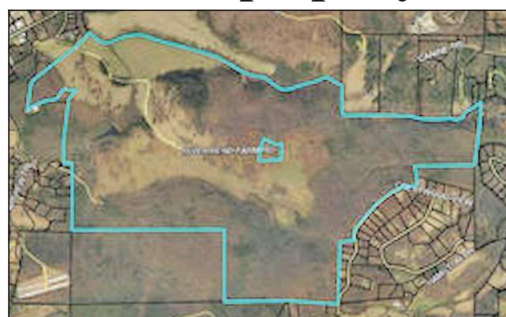
The large River Bend Farm Road property is located off Old Blue Ridge Highway adjacent to the Nottely River.

Added Payne, "There are One Investors, Cory Payne said around 30 or 40 acres in the See UGH Property Sale, Page 2A