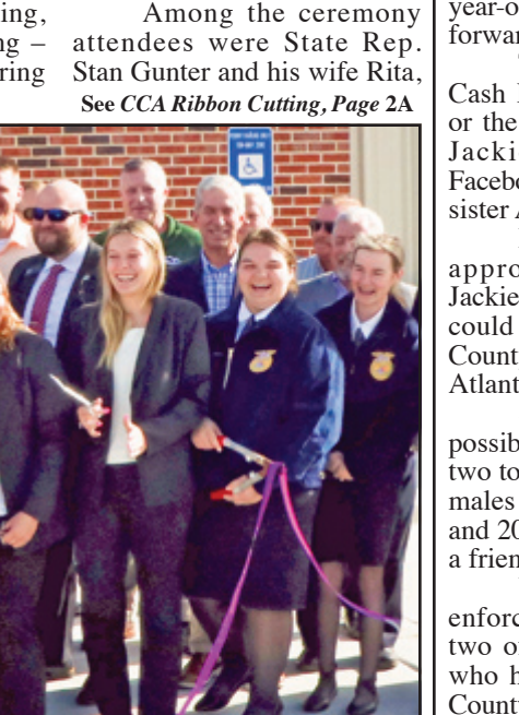
The College and Career Academy at Union County High will be producing opportunities for students to find local jobs for

On top of the skilled trades, the College and Career Academy also offers pathways in agriculture, computer science, education, entrepreneurship, nursing, and sports medicine, with options for work-based learning in the regional community.